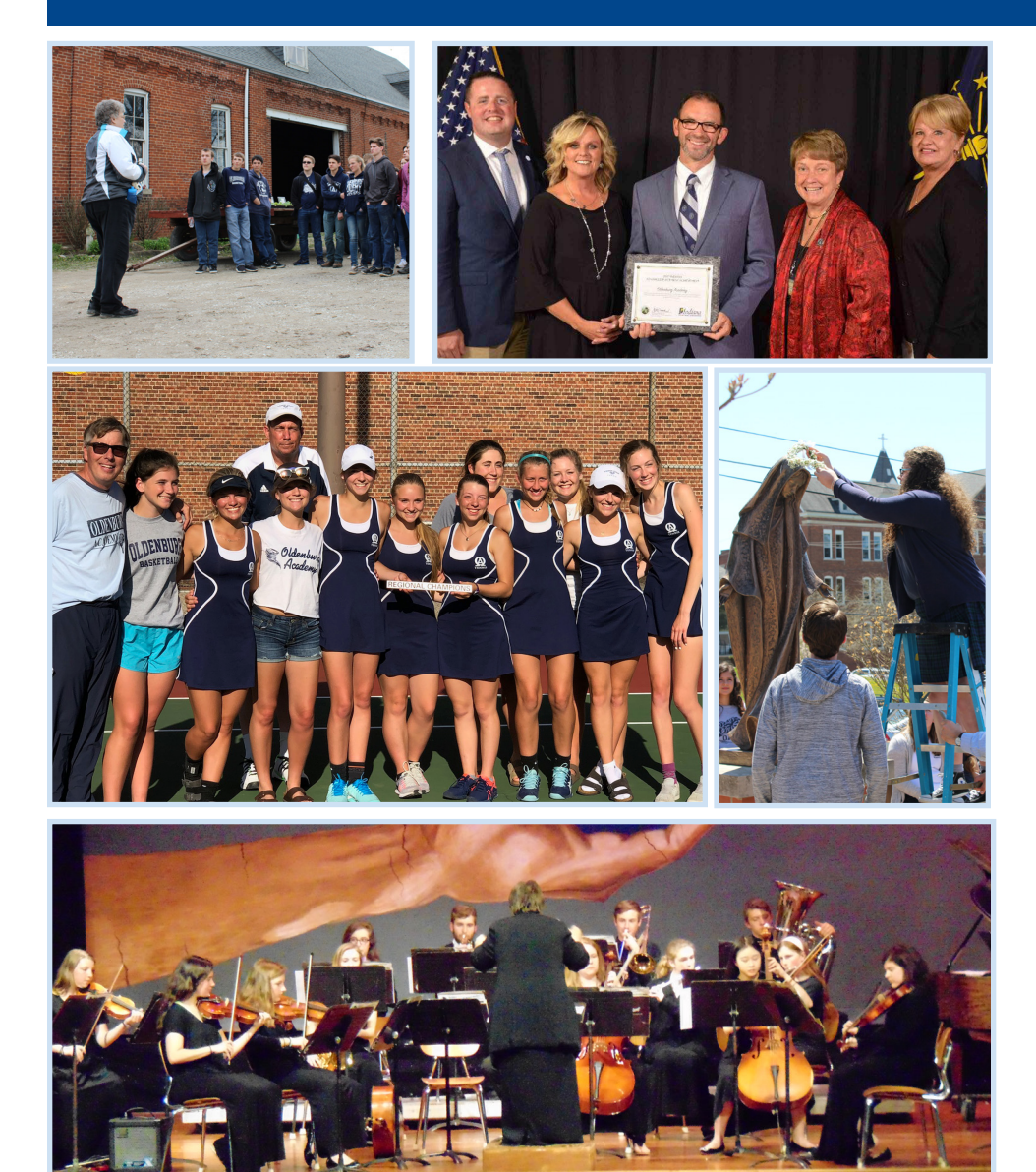
Top to Bottom, Left to Right: Sophomore retreat at Michaela Farms; AP scores recognition; Girls' Tennis wins regionals; May crowning; orchestra playing at Spring Concert - Care of Creation