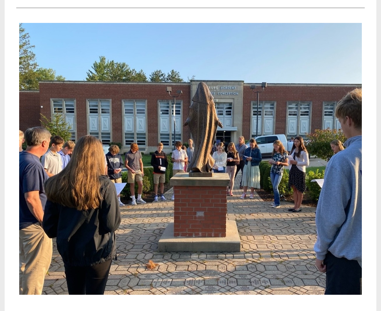
Join us in the front of school every Wednesday for Wednesday Morning Prayer from 8:05 - 8:15 am!

Pictured in the first photo is the class of 2021 volleyball players with the current senior volleyball players from the class of 2024.