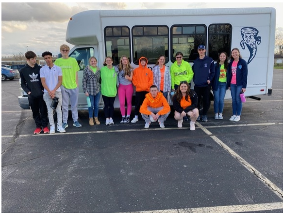
Congratulations to the Boys Basketball Team for competing in Regionals! Thanks to all of the OA fans for supporting the team!