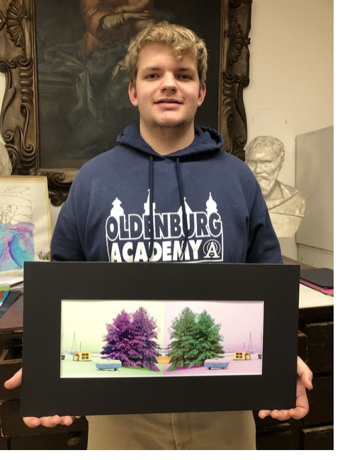
OA Art students donate to the OA Dinner Auction